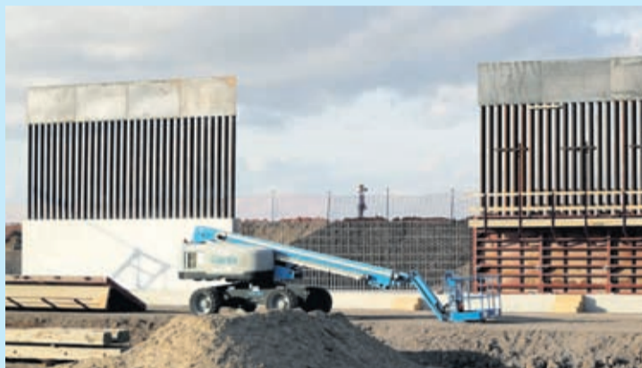
In this Nov. 7, 2019, file photo, the first panels of levee border wall are seen at a construction site along the U.S.-Mexico border, in Donna, Texas. Major construction projects moving forward along the U.S. borders with Canada and Mexico amid the coronavirus pandemic are raising fears workers could spread the sickness within nearby communities.

Residents, tribal leaders and state officials have warned that the influx